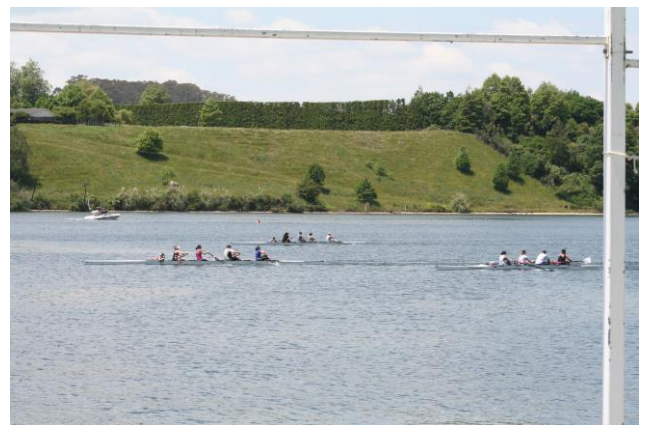
DPA Christmas Function - Rowing on Lake Karapiro

And finally, we are looking for a new team member - if you know someone that has accounting experience, specifically with Xero, we want to hear from them, check out our blog on the website for full details.